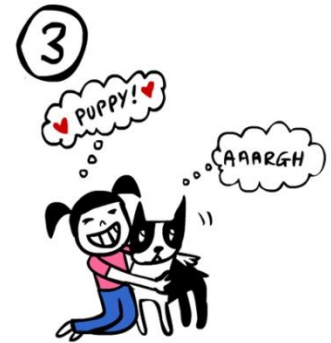
DON'T Grab or Hug him