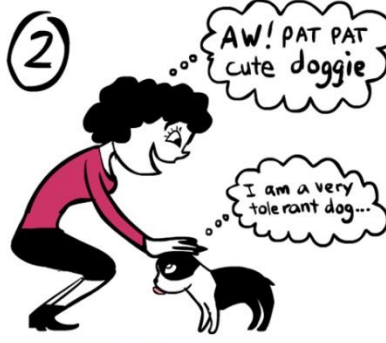
DON'T Lean over the dog & stick your hand on top of his head