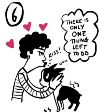
DON'T Grab his head and kiss it (This is an invasion of space)

Doing this to a dog who doesn't know you is like a perfect stranger giving you a great big hug and kiss in an elevator. Wouldn't that creep you out? And wouldn't you have the right to defend yourself?