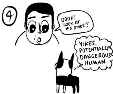
DON'T Stare him in the eye (This is an adversarial gesture)