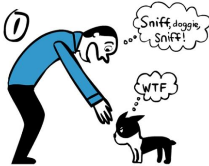
DON'T Lean over the dog & stick your hand in his face

Most people do this stuff and it stresses dogs out so they BITE! I don't care how cute you (or your kid) think Boogie is. Please show him some respect.