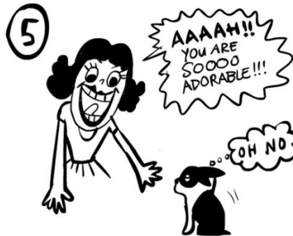
DON'T Squeal or shout in his face